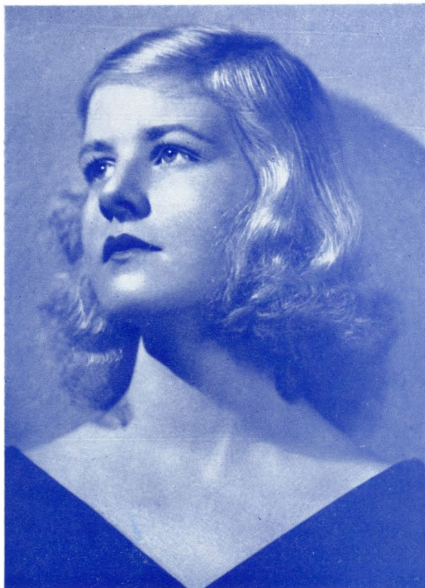
Portrait by Petrelle

For that delicate nuance of tone that spells "Color"